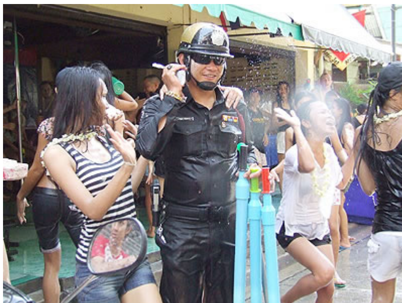
Not even the police were immune from a complete soaking during last year's Songkran festivities

The most obvious celebration of Songkran is the throwing of water. People roam the streets with containers of water or water guns, or post themselves at the side of roads with a garden hose and drench each other and passers-by. This, however, was not always the main activity of this festival. Songkran was traditionally a time to visit and pay respects to elders, including family members, friends and neighbours – sound like a long time ago!!